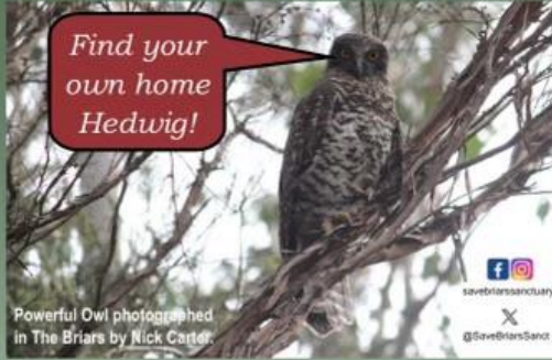
Powerful Owl photographed in The Briars by Nick Carter.