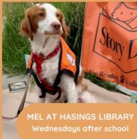
MEL AT HASINGS LIBRARY Wednesdays after school

Improve your child's reading with the help of a trained companion dog and handler.